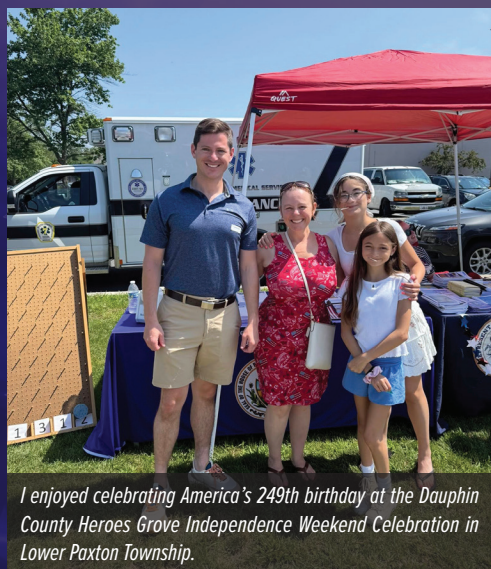
I enjoyed celebrating America's 249th birthday at the Dauphin County Heroes Grove Independence Weekend Celebration in Lower Paxton Township.