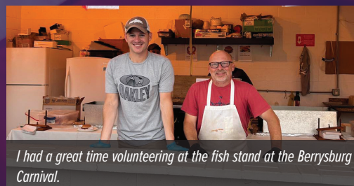
I had a great time volunteering at the fish stand at the Berrysburg Carnival.