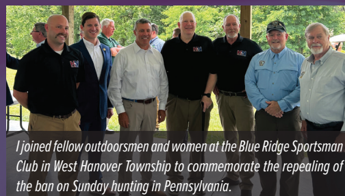
I joined fellow outdoorsmen and women at the Blue Ridge Sportsman Club in West Hanover Township to commemorate the repealing of the ban on Sunday hunting in Pennsylvania.