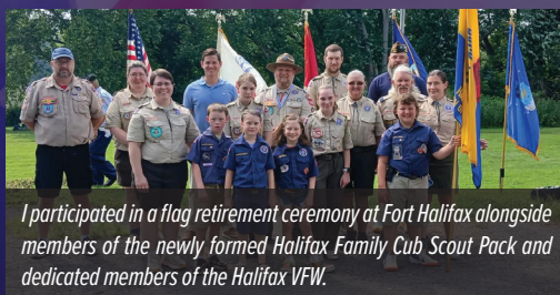
I participated in a flag retirement ceremony at Fort Halifax alongside members of the newly formed Halifax Family Cub Scout Pack and dedicated members of the Halifax VFW.